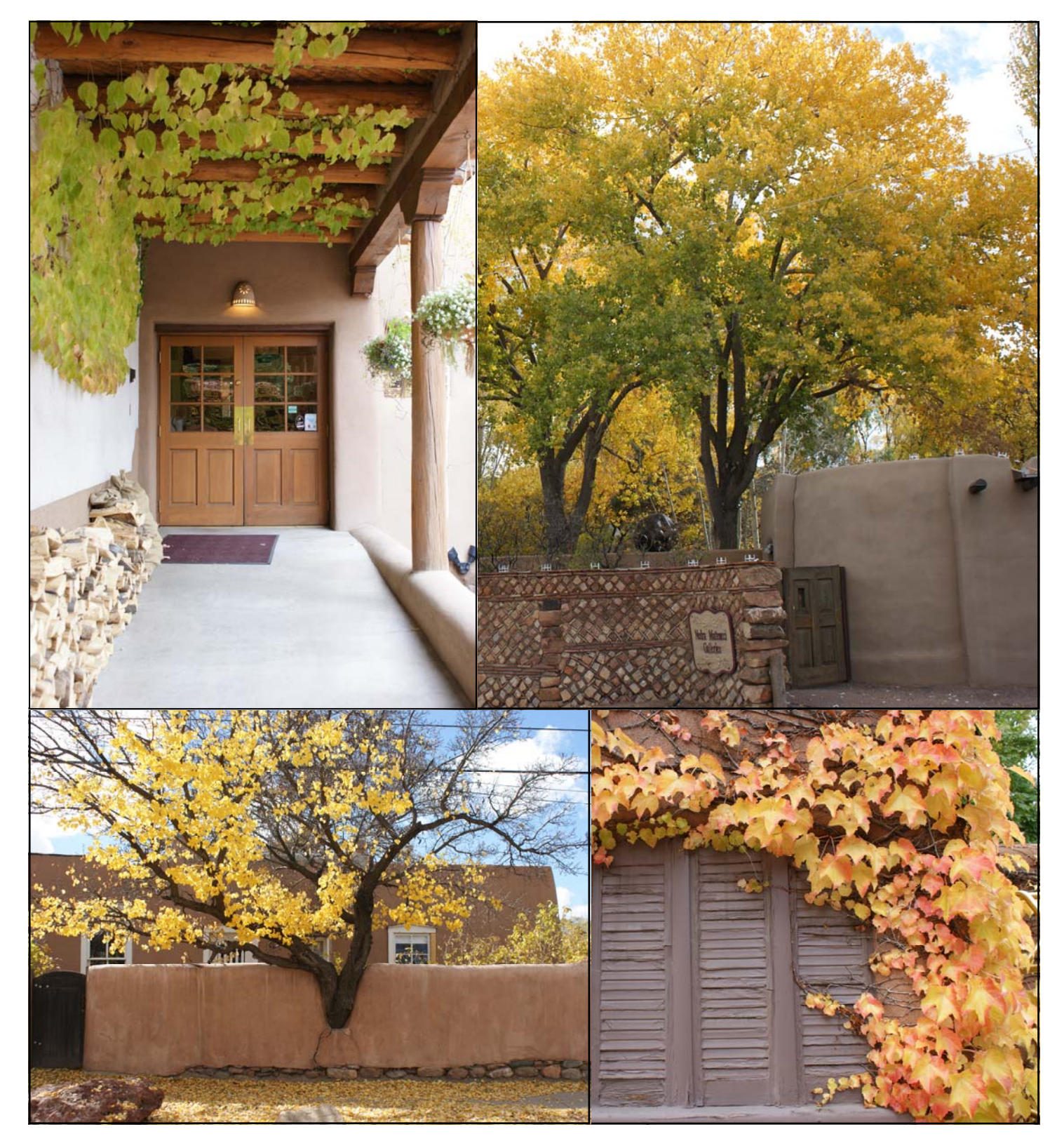
Financing Your Future, Believing in New Mexico