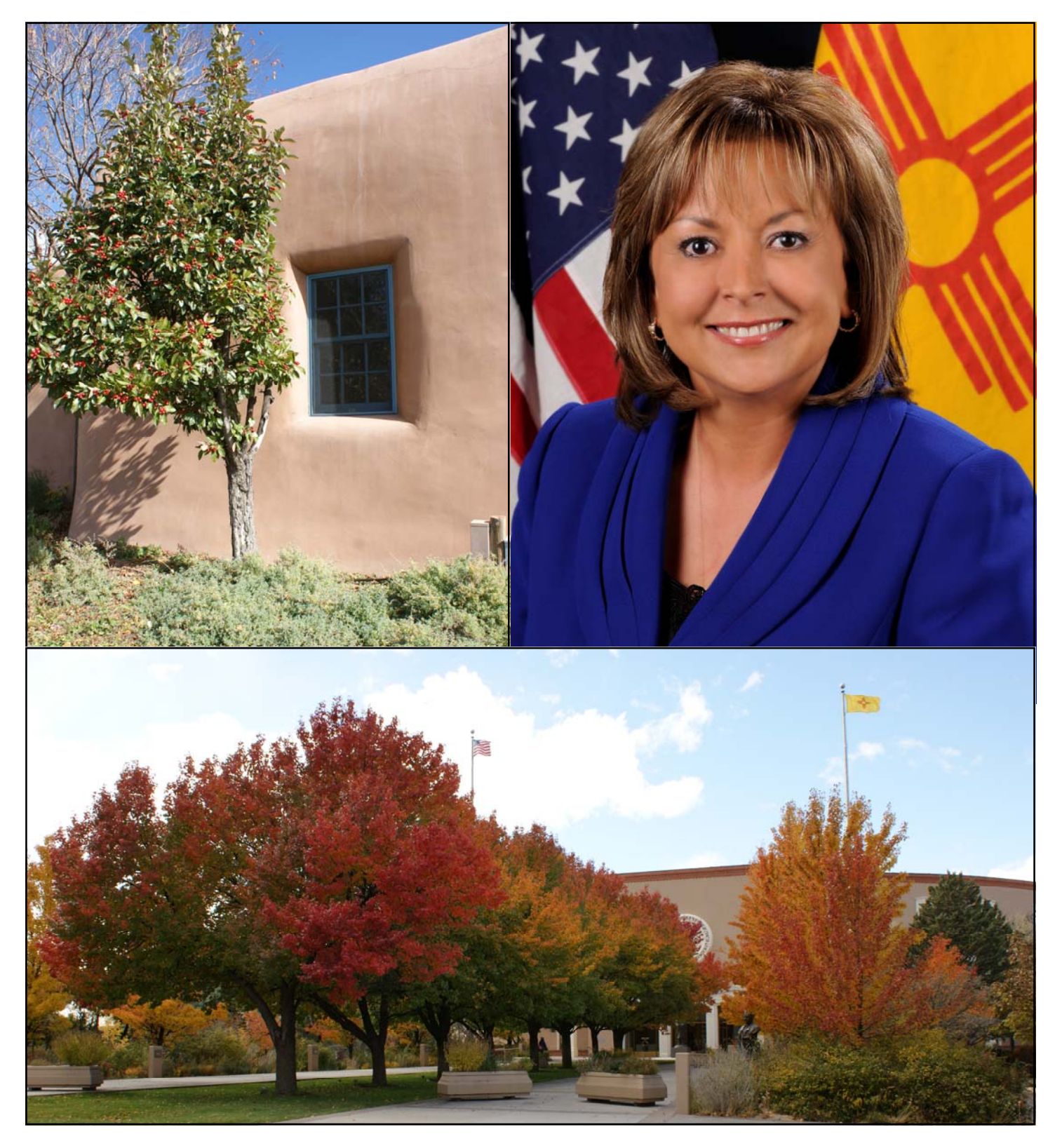
Financing Your Future, Believing in New Mexico