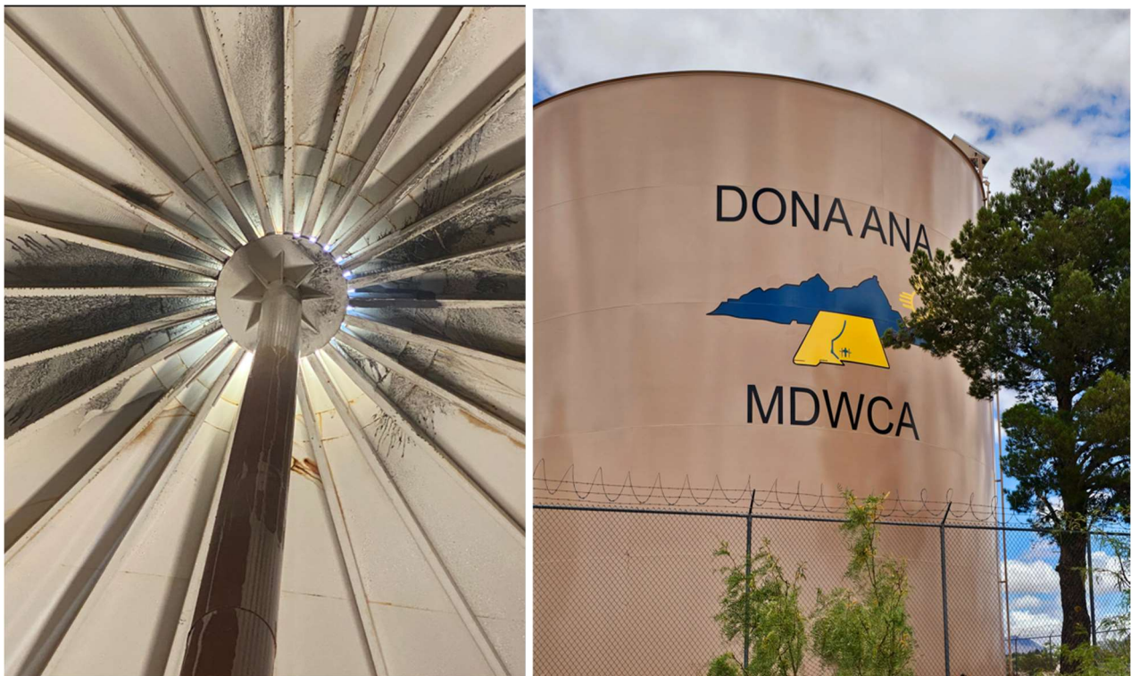
Dona Ana MDWCA – Tank Rehabilitation

On July 31, 2023, NMFA received 91 Notices of Intent to file an application. On September 15, 2023, 66 applications totaling more than $276.7 million were filed.