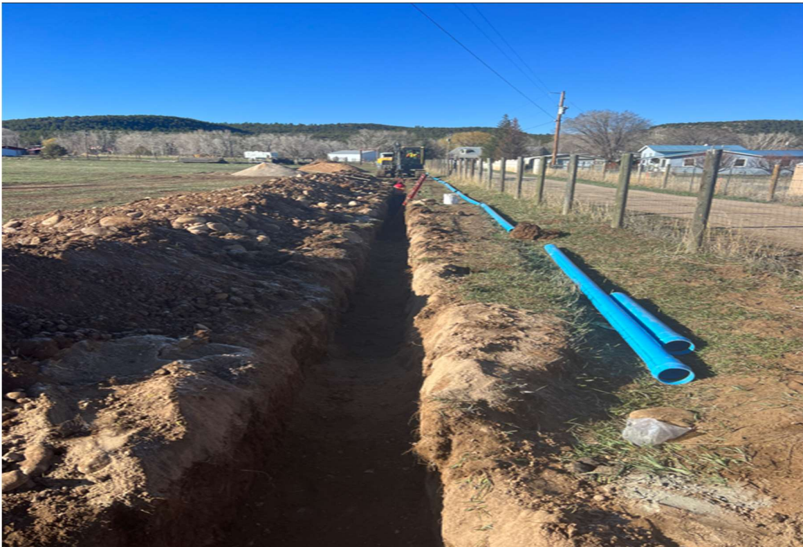
Rio Lucio MDWCA – Waterline Replacement

In FY 2024, NMFA closed 47 Water Trust Board funding agreements, and 28 projects were certified as complete. In addition, approximately $40.5 million of WPF funds were disbursed in FY 2024 for eligible project costs.