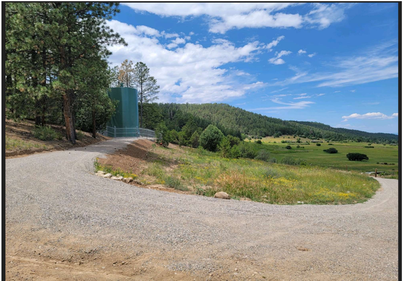
Union del Llano MDWCA – Phase III Storage Tank