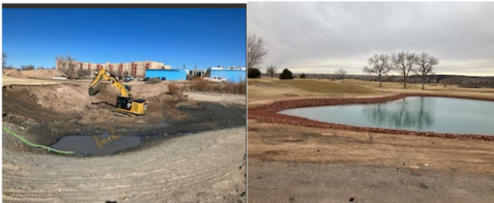
City of Albuquerque – Ladera Park Water Conservation Project