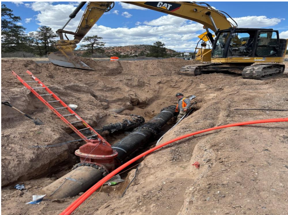
Los Alamos County – NM State Rd. 4 Water Transmission Line Replacement

In FY 2025, NMFA closed 43 Water Trust Board funding agreements, and 25 projects were certified as complete. In addition, approximately $76.8 million of WPF funds were disbursed in FY 2025 for eligible project costs.