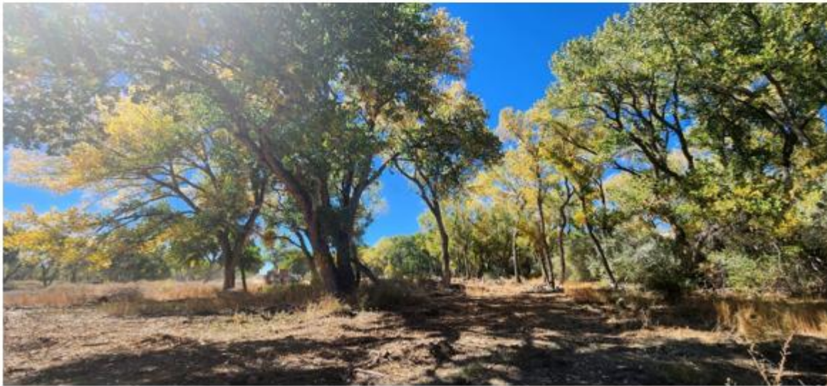
San Juan SWCD – San Juan Basin Watershed Riparian Restoration