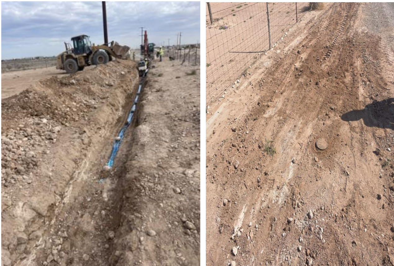
Otis MDWC&SWA – Waterline Looping

From July 15 to September 16, 2024, NMFA received 102 Notices of Intent to file an application. On September 16, 2024, 84 applications totaling more than $256 million were filed.