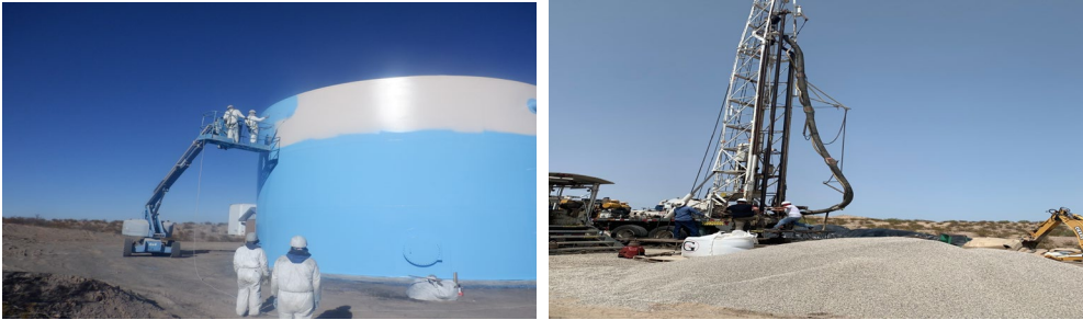
Chamberino MDWCA – Storage Tank and Waterline Project

The CIB is dedicated to reviewing its policies, criteria and processes annually to further improve upon the program and adapt to any changes that may affect either the timeliness of expenditures or the availability of future funding to the Colonias Infrastructure Fund. With the guidance of the current CIB policies and the assistance of NMFA staff, communities are better prepared for project funding.