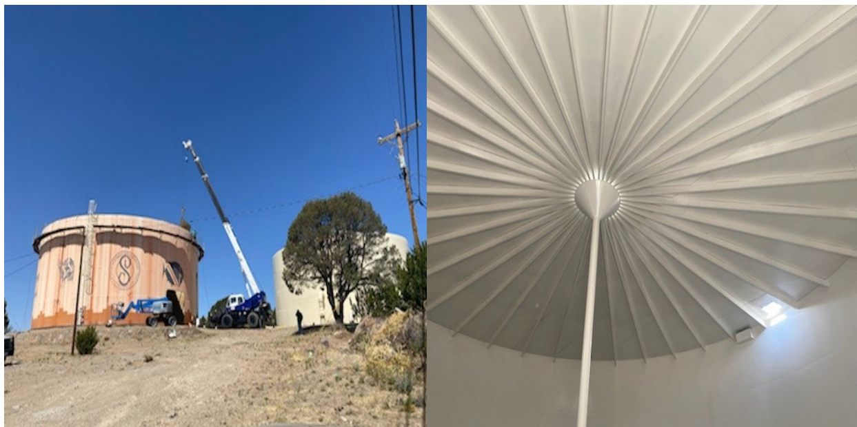
Town of Silver City – Water Storage Tank Renovations

A total of 31 projects were awarded by the Colonias Infrastructure Board for the 2023 cycle in the amount of $67,445,000. A remaining balance of $115,000 was set-aside for construction cost overruns for the 2023 awardees.