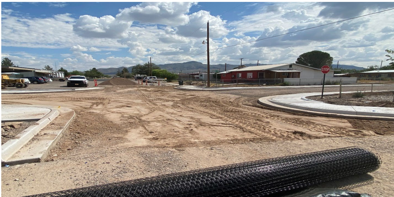
Village of Williamsburg – Roadway/Drainage Project

For each application cycle, NMFA staff conducts application workshops for the public targeting the southeastern, south central and southwestern areas of the state. The application workshops continue to be held virtually to allow flexibility for more entities to participate. These workshops provide an in-depth review and instruction to all entities on the application process, requirements for eligible entities and projects, and financial assistance structures, as well as guidance on the rules, policies, and processes of the program.