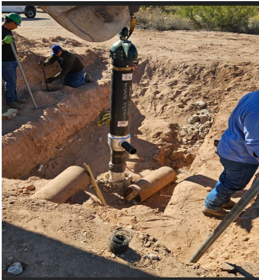
Garfield MDWCA – Replacement Well Project

For each application cycle, NMFA staff conducts application workshops for the public targeting the southeastern, south central and southwestern areas of the state. The application workshops continue to be held virtually to allow flexibility for more entities to participate. These workshops provide an in-depth review and instruction to all entities on the application process, requirements for eligible entities and projects, and financial assistance structures, as well as guidance on the rules, policies, and processes of the program.