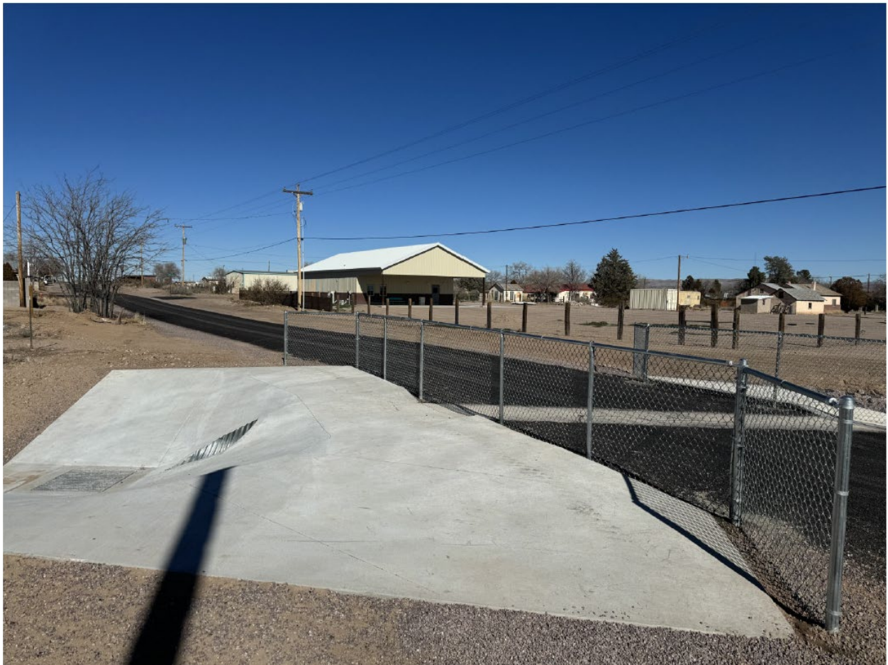
Socorro County – San Antonio Drainage Project