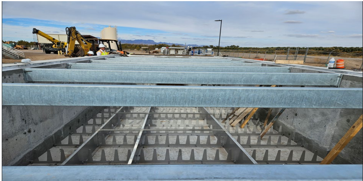
Dona Ana County – Wastewater Treatment Plant

*2024 Cycle: 31 projects awarded May 16, 2024; 5 projects (2 nd Iteration) awarded September 19, 2024.