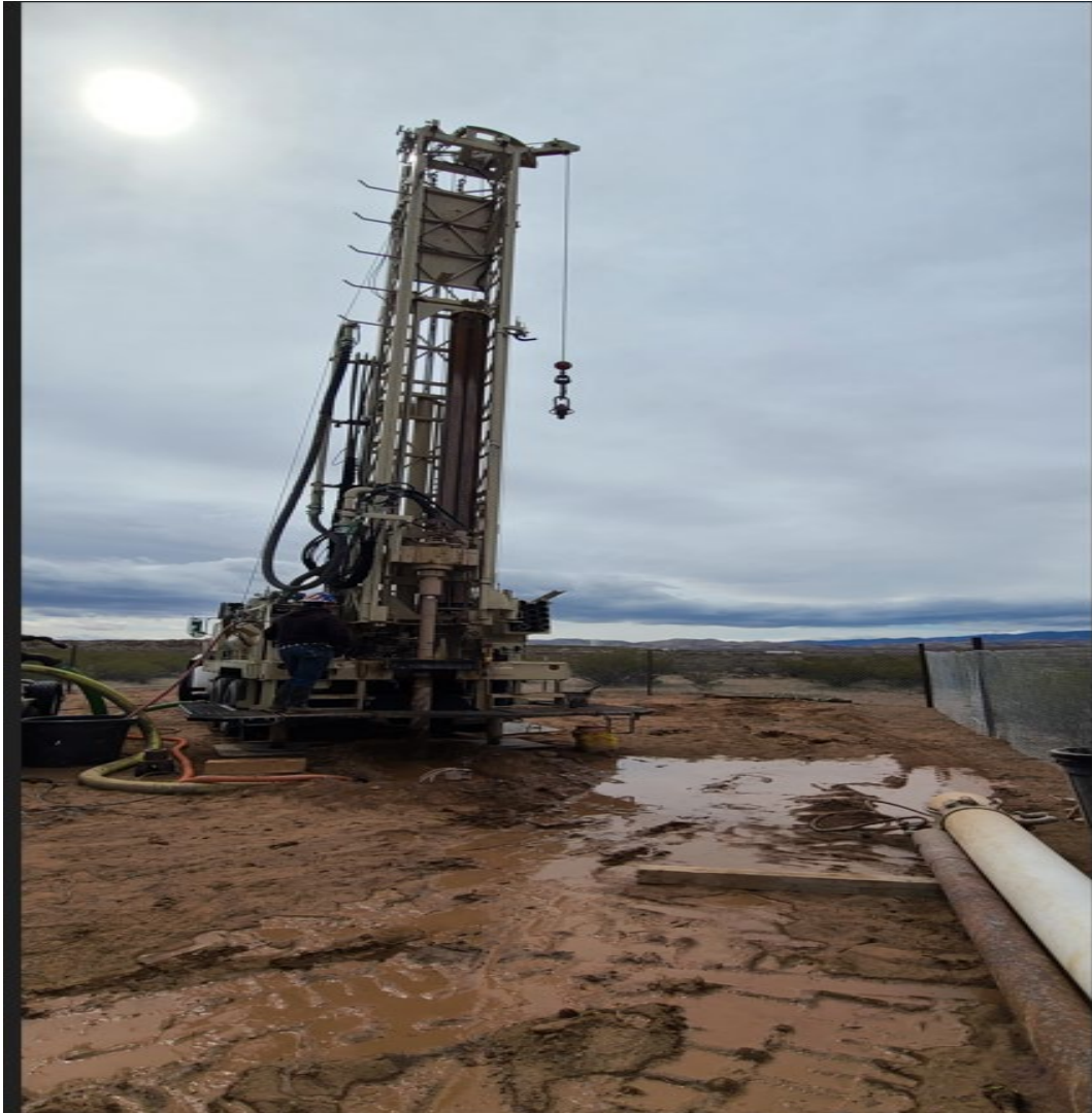
San Antonio MDWCA – Exploratory Well Project

A total of 36 projects were awarded (31 on May 16; 5 on September 19) by the Colonias Infrastructure Board for the 2024 cycle in the amount of $59,577,119. The remaining balance will be determined at the CIB meeting in March 2025, with a possible 3 rd iteration of funding for the remaining applicants.