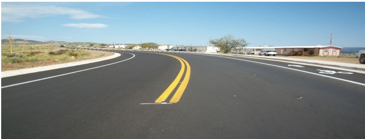
Town of Silver City – Ridge Road Project

In previous application cycles, NMFA staff conducted application workshops for the public targeting the southeastern, south central and southwestern areas of the state. Due to the health and safety concerns related to the COVID-19 pandemic, the application workshops were held virtually. These workshops provide an in-depth review and instruction to all entities on the application process, requirements for eligible entities and projects, and financial assistance structures, as well as guidance on the rules, policies, and processes of the program.