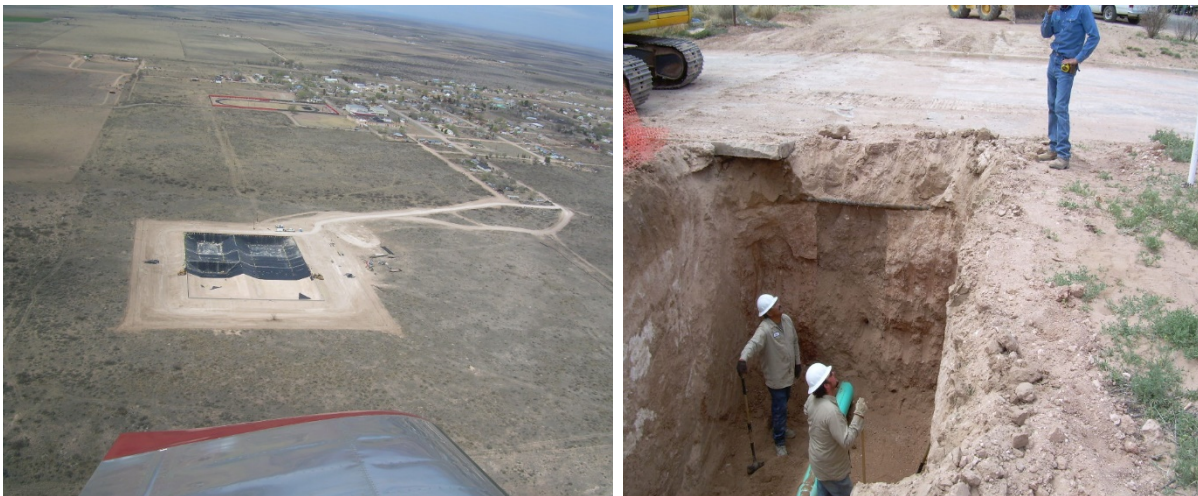
Town of Lake Arthur – Wastewater Lagoon and Sewer Lines

Colonia communities must provide documentation to the CIB that supports the designation by the municipality or county.