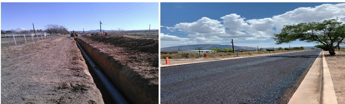
Town of Carrizozo – Street/Drainage Waterline Replacement

The CIB is dedicated to reviewing its policies, criteria and processes annually to further improve upon the program and adapt to any changes that may affect either the timeliness of expenditures or the availability of future funding to the Colonias Infrastructure Fund. With the guidance of the current CIB policies and the assistance of NMFA staff, communities are better prepared for project funding.