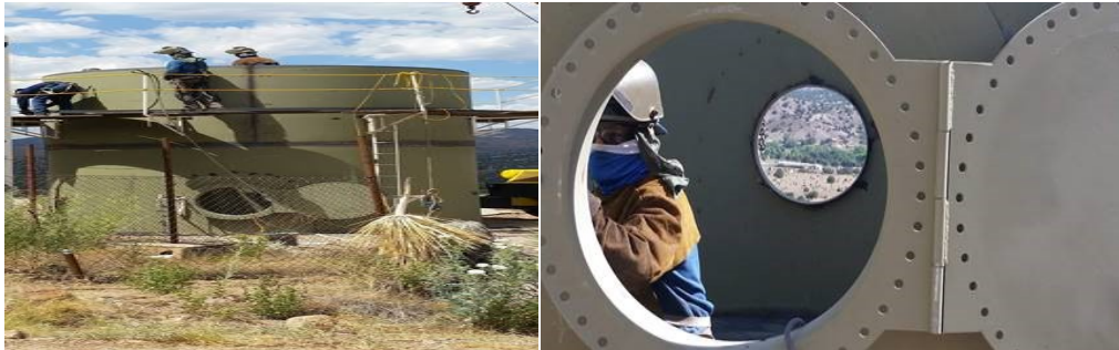
Casas Adobes MDWCA – Water Tank; Automate System Improvements