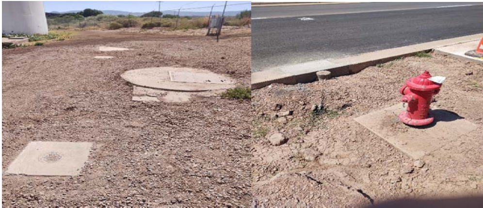
Village of Tularosa – Waterline Project

In FY 2020, NMFA closed 25 Colonias Infrastructure Board funding agreements and 16 projects were certified as complete. In addition, approximately $8.2 million of CIF funds were disbursed in FY 2020 for eligible project costs.