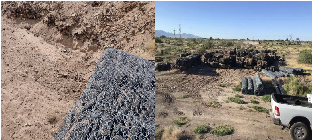
City of Deming – Tulip Landfill-Tire Bales Erosion Control

Colonia communities must provide documentation to the CIB that supports the designation by the municipality or county.