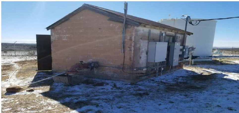
Village of Santa Clara – Booster Station

The CIB is dedicated to reviewing its policies, criteria and processes annually to further improve upon the program and adapt to any changes that may affect either the timeliness of expenditures or the availability of future funding to the Colonias Infrastructure Fund. With the guidance of the current CIB policies and the assistance of NMFA staff, communities are better prepared for project funding.