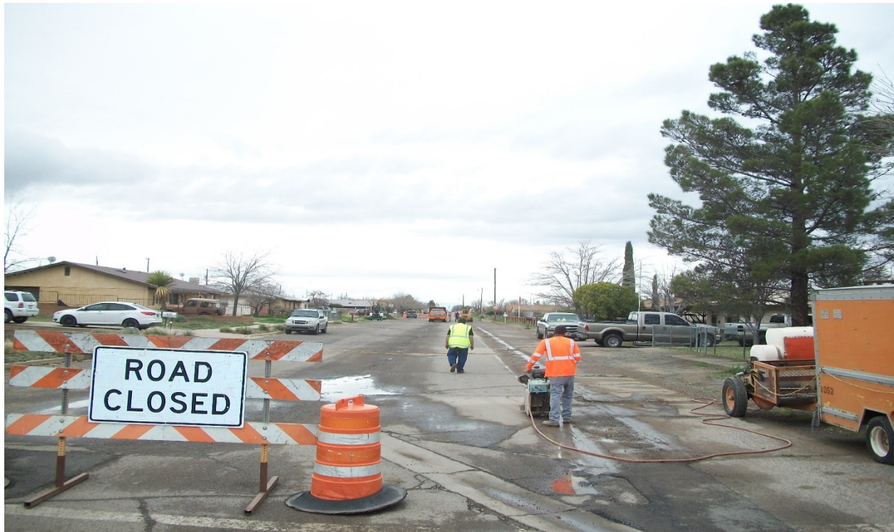
City of Lordsburg – Waterline Installation-Street Repair